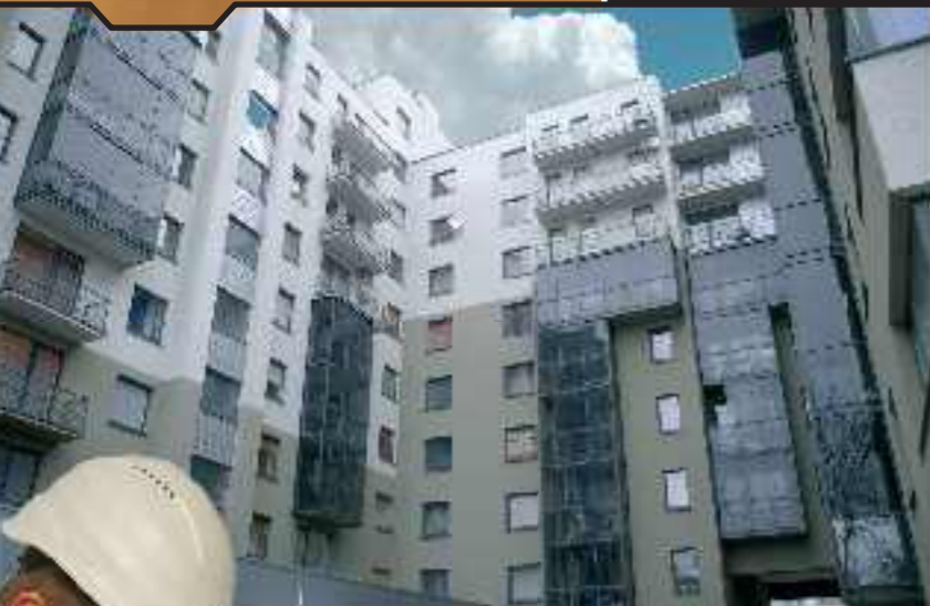
◀ Block of flats with commercial premises in S. Žukausko St. 1 / Ulonų St. 1, Vilnius