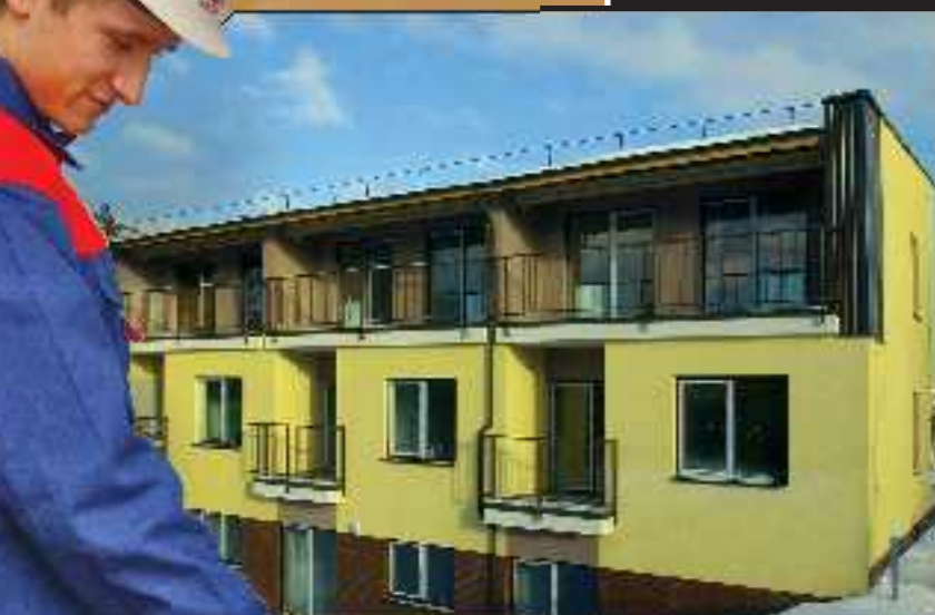
◀ Block of flats in Vilpėdės St. 3F, Vilnius